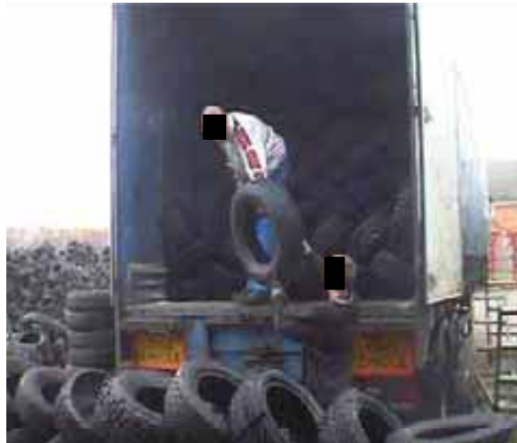
Figure 8. Loading tyres in factory yard.

This operation applies to loads of similar tyre casings being brought in for retreading and to loads of retreaded tyres being sent out to customers by lorry. Some companies have no loading bay facilities and this creates particular handling difficulties.