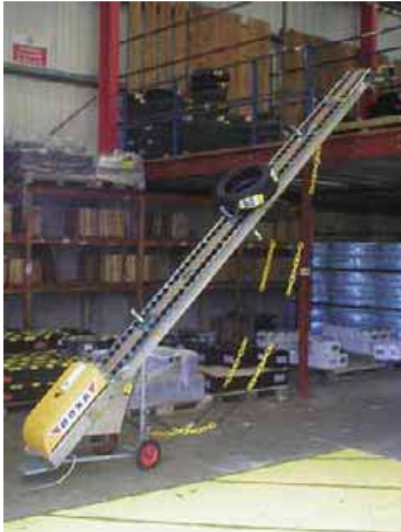
Figure 2. A conveyor used to transport tyres to and from a mezzanine floor store.