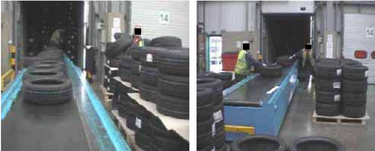
Figure 11. Loading/unloading a trailer using a powered conveyor.