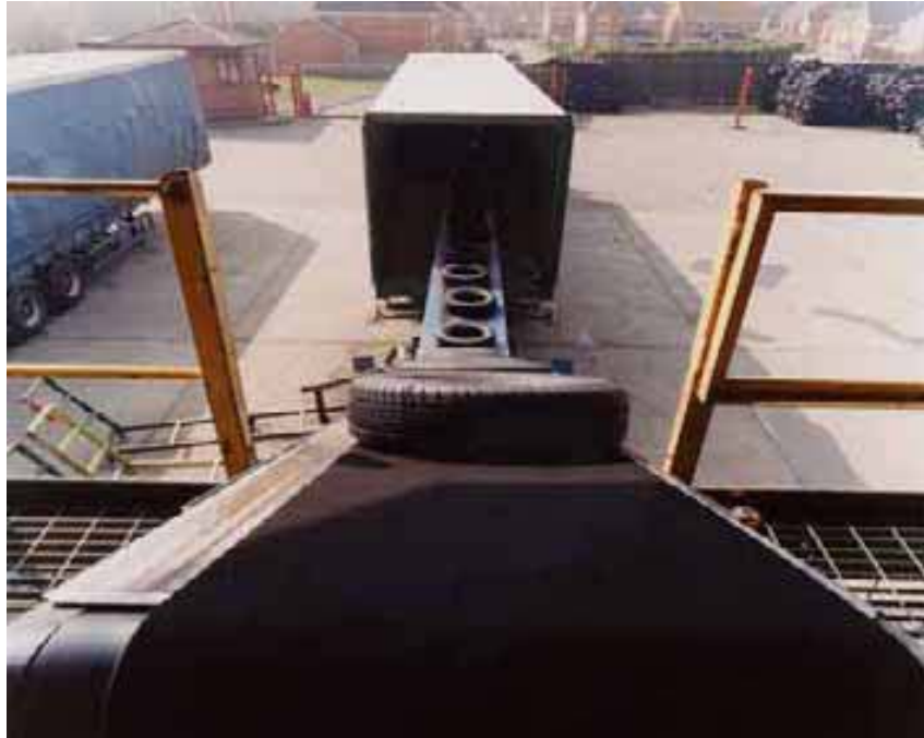
Figure 9. Conveyor feeding retreads into delivery vehicle.