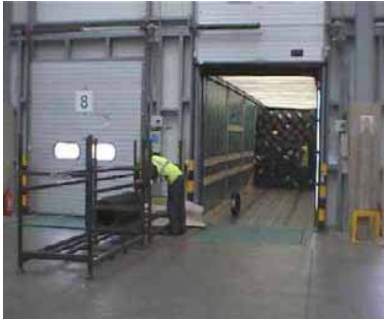
Figure 10. Loading/unloading a trailer at a distribution centre.

At distribution centres or where large quantities of similar tyres are being unloaded or despatched for single drop delivery there may be intensive manual handling associated with stacking and un-stacking (laced or otherwise), or transferring tyres from stillages to stacks.