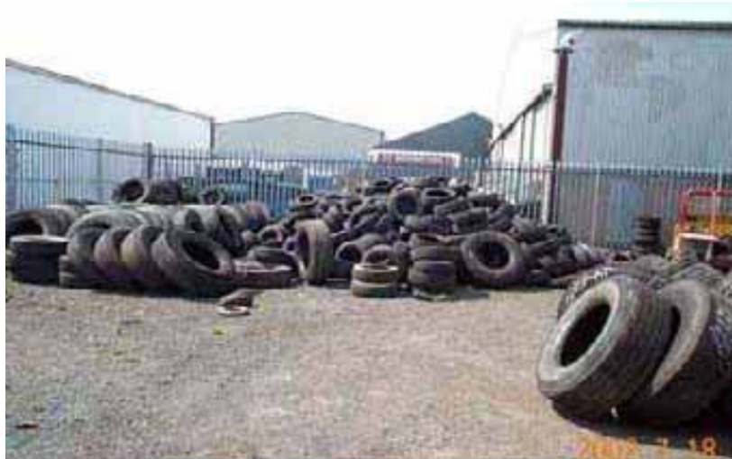
Figure 16. Bad practice. How not to store used tyre casings!