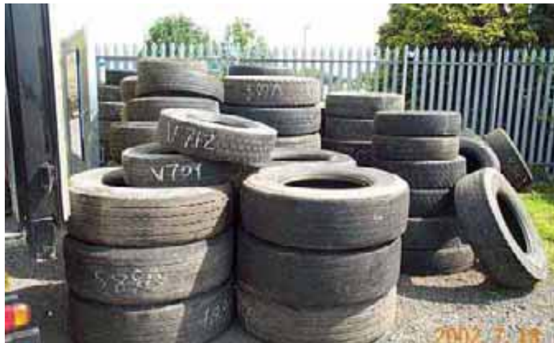
Figure 15. Bad practice. Large tyre casings stacked horizontally. They now have to be lifted off and turned to the vertical for rolling to the collection vehicle.