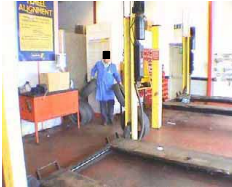
Figure 4. Sometimes tyres are carried through the fitting bay, in which case a carrying assessment should also be made.