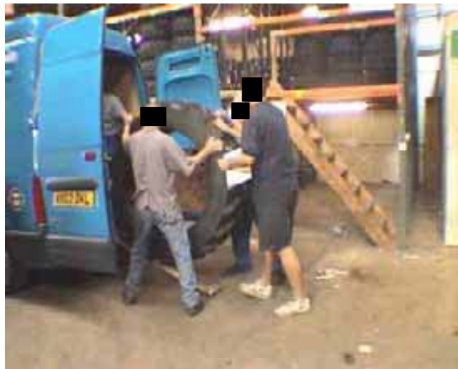
Figure 6. Loading an agricultural tyre.

At this site the wholesaler loads a fleet of small vehicles with a wide variety of new tyres from warehouse stock, for delivery to retailers on a set of routes. The routes are repeated each day, but the tyres transported vary considerably from day to day. The company have specified their own fleet of vehicles for the purpose. In particular, the vehicles have a low internal floor level (less than 500mm above ground level) which aids the loading and unloading process. The range of tyres transported varies from 1kg for pneumatic trolley tyres to 90-100kg for typical tractor tyres. The largest tractor tyre weighs over 170kg (520/85R38).