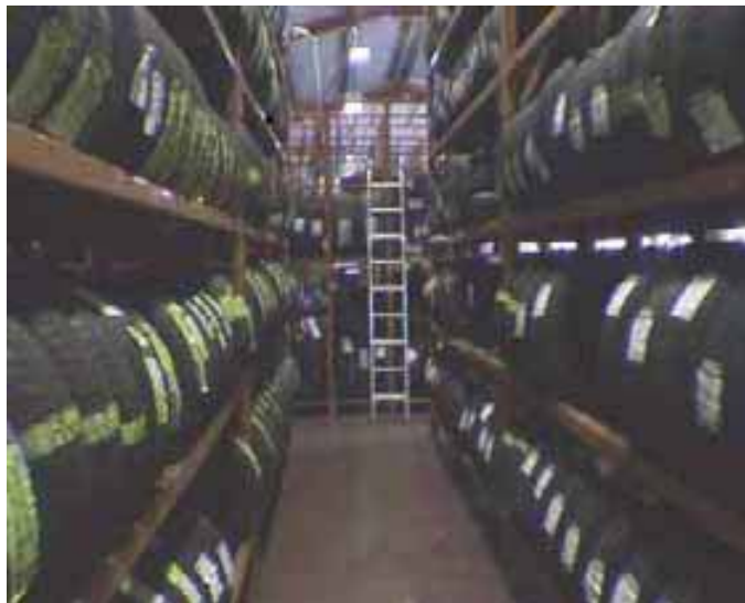
Figure 1. Car tyre stock racking at a retail premises.

This task is performed daily. A delivery of new tyres can range from 6 to 30 or more tyres for a typical depot. The duration of the task is therefore short, even when a single member of staff does it. The tyres are unloaded from the delivery van and are usually stacked temporarily on the floor, or stood upright in rows, before being placed into racking like that shown in Figure 1. This can involve climbing a set of steps.