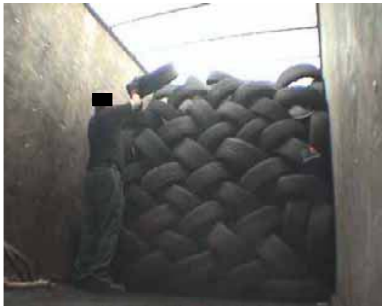
Figure 5. Lacing the casings inside the collection vehicle. A roof letting in daylight like this one makes the job easier.