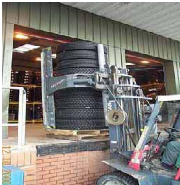
Figure 12. Fork truck fitted with tyre clamp.

If the loads can be stacked, and at this site some were stacked rather than laced, it allows for the possibility of handling batches of tyres mechanically. At a different loading bay this was being tried out with a fork truck fitted with a new clamp attachment, (see Figure 12). The truck was used to load and unload trailers with stacks of tyres. The rotating head of the clamp attachment enabled tyres to be lifted from and placed into stillages directly.