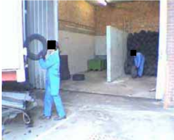
Figure 3 Transferring casings from the storage area to the collection vehicle.

This operation is performed regularly, for example, once or twice weekly, and lasts for an hour or so, depending on the size of the retail premises and the rate at which they accumulate scrap casings. Collections of 150 to 400 tyres per week are normal.