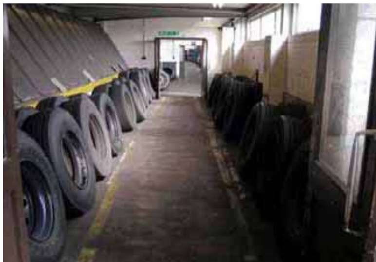
Figure 14. Good practice. Large tyres kept vertical makes collecting and rolling them easy.