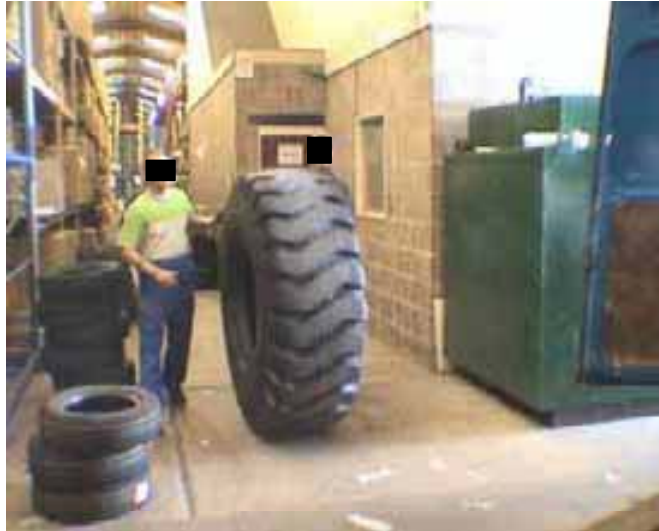
Figure 7. Some of the tyres can be very large.